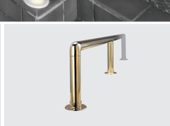
Low Line Posts