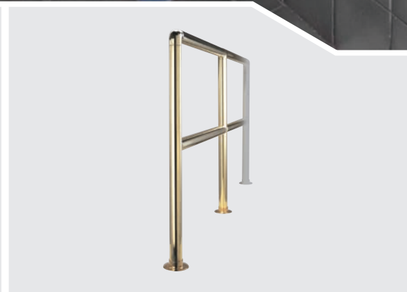
Double Line Posts