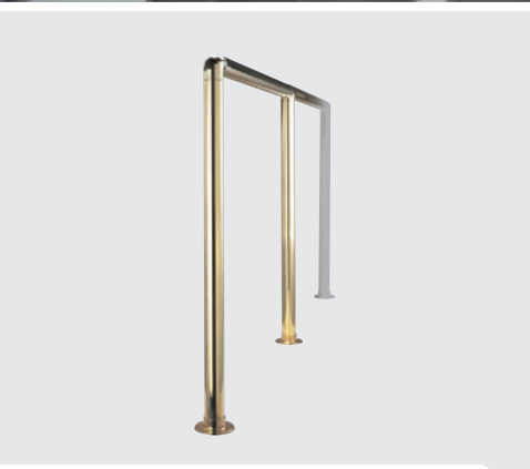
Single Line Posts