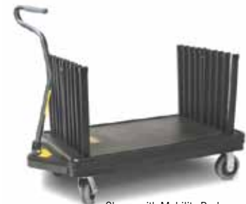
Shown with Mobility Package