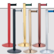
Beltrac® Retractable-belt Posts