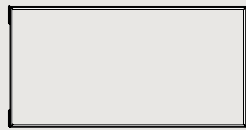
(1) Slim Frame