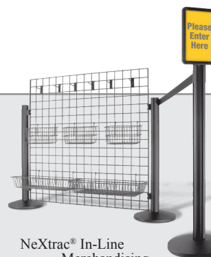
NeXtrac® In-Line Merchandising