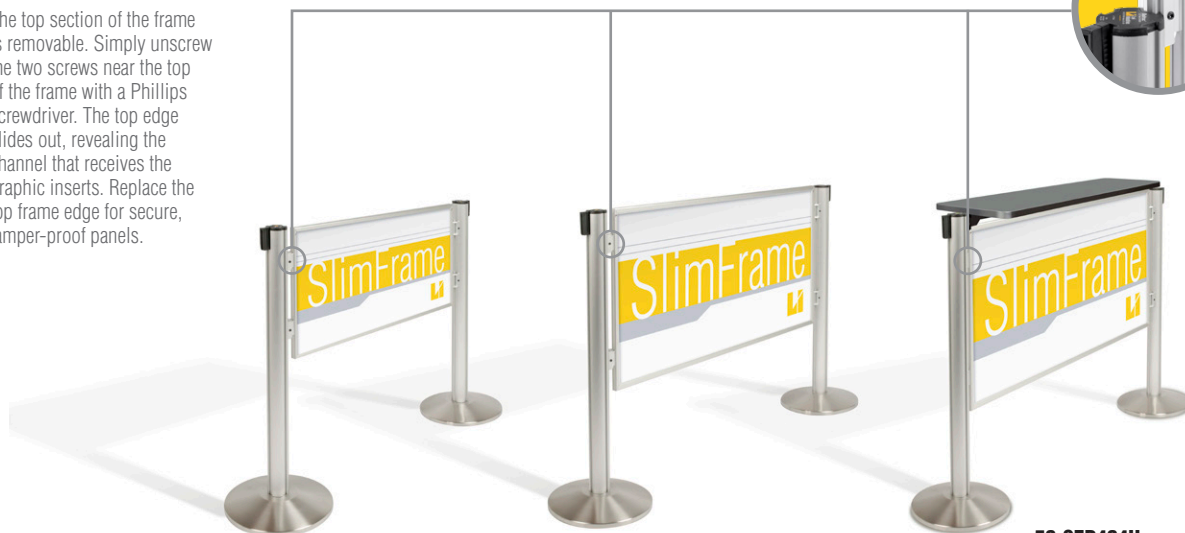
50-SFP401H 36" x 18"