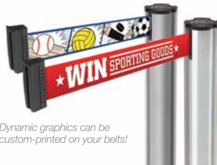
Dynamic graphics can be custom-printed on your belts!

Custom graphics can support your brand or highlight upcoming events. We can assist in creating custom artwork with our full-service Graphics Department.