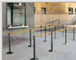
Belted Queuing Stanchions