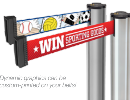
Dynamic graphics can be custom-printed on your belts!

Custom graphics can support your brand or highlight upcoming events. We can assist in creating custom artwork with our full-service Graphics Department.