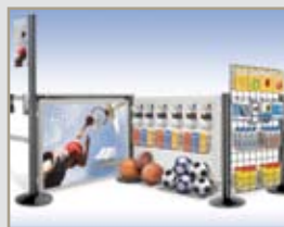
Concession Merchandising Solutions