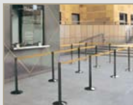
Belted Queuing Stanchions