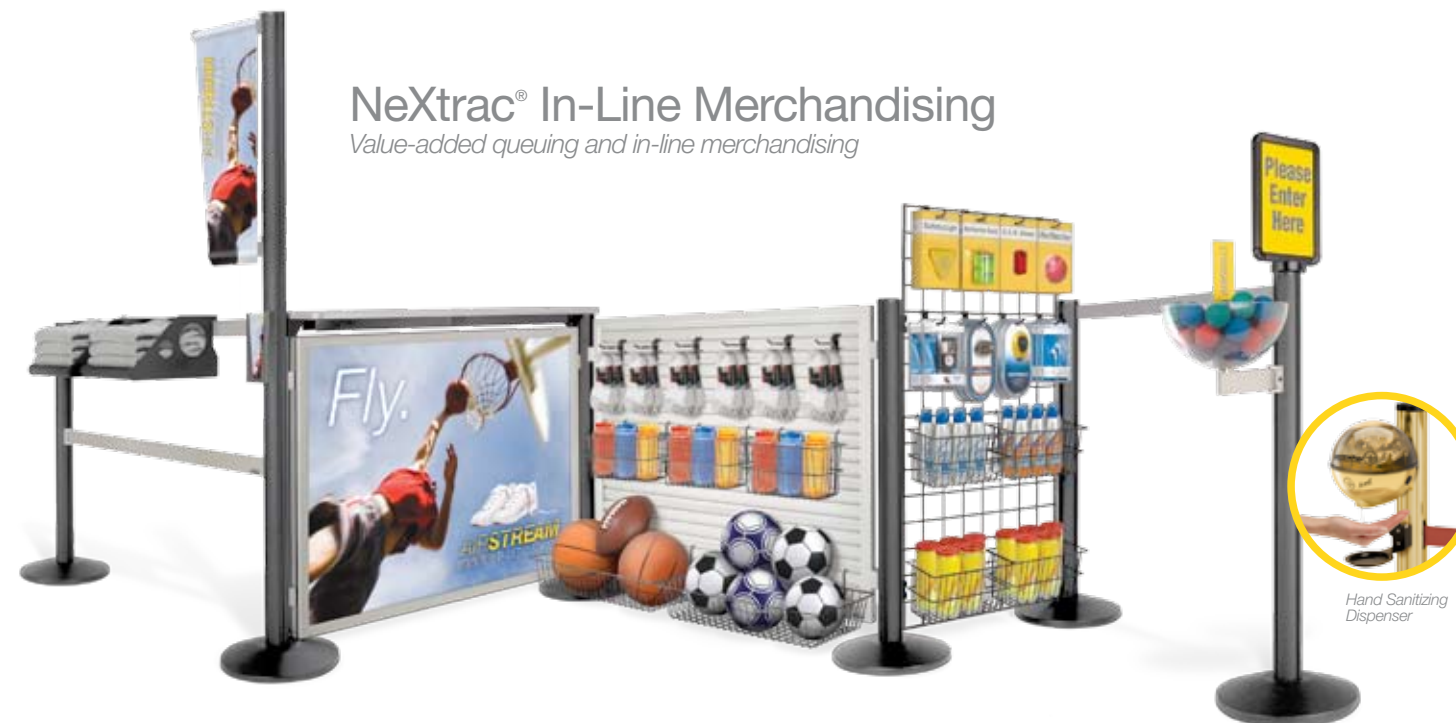
Hand Sanitizing Dispenser

Value-added queuing and in-line merchandising