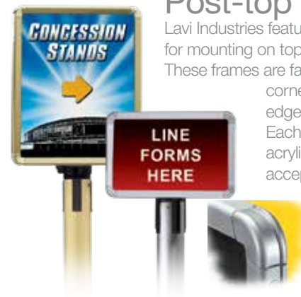
Smooth radius corners eliminate sharp edges near your customers.

These frames are fabricated with radius corners, eliminating sharp edges near your customers. Each frame includes twin clear acrylic panels designed to accept regular paper media.