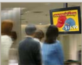
Electronic Queuing and Digital Signage