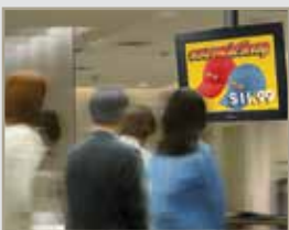
Electronic Queuing and Digital Signage