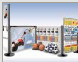
Concession Merchandising Solutions