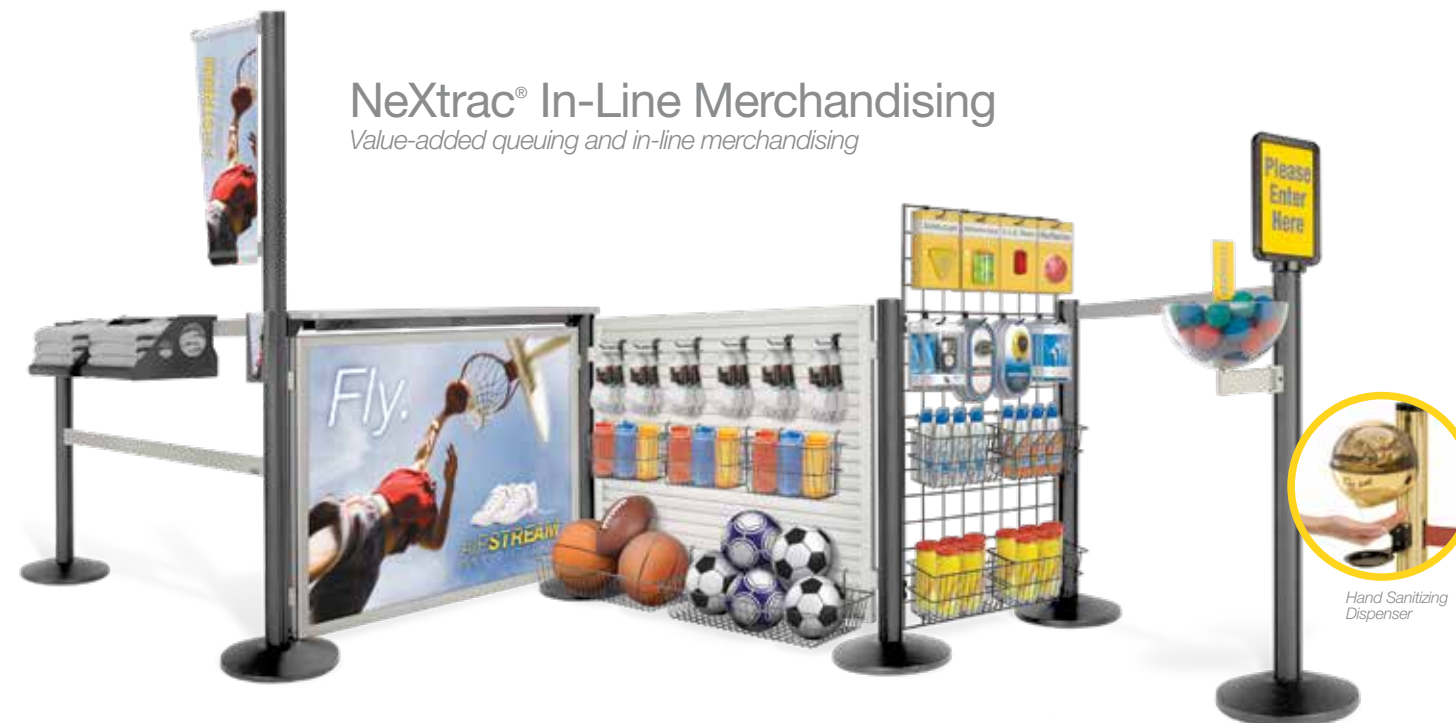
Hand Sanitizing Dispenser

Value-added queuing and in-line merchandising