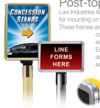
Smooth radius corners eliminate sharp edges near your customers.

These frames are fabricated with radius corners, eliminating sharp edges near your customers. Each frame includes twin clear acrylic panels designed to accept regular paper media.