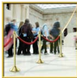
Traditional Crowd Control Solutions