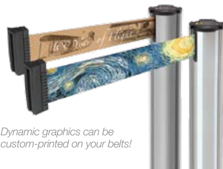
Dynamic graphics can be custom-printed on your belts!

Custom graphics can support your brand or highlight upcoming events. We can assist in creating custom artwork with our full-service Graphics Department.