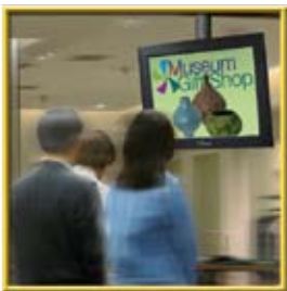
Electronic Queuing and Digital Signage