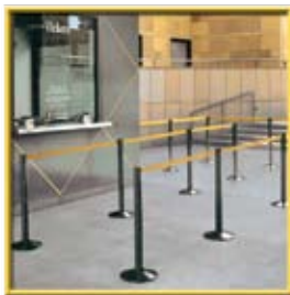
Belted Queuing Stanchions