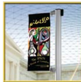
Signage and Wayfinding Solutions