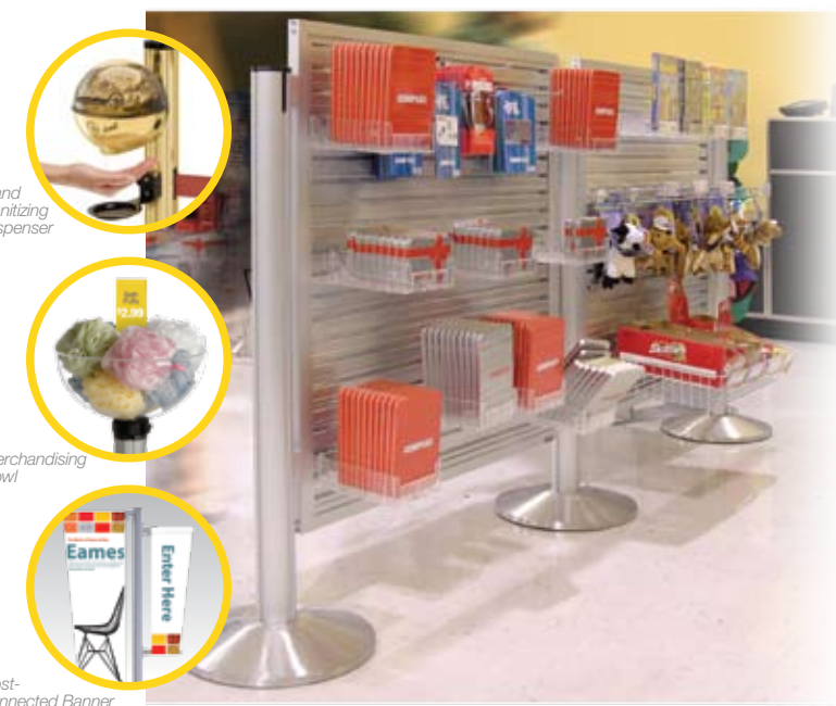
Hand Sanitizing Dispenser