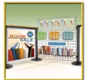
Store Merchandising Solutions