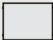
(1) Hinged Frame