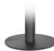
Slim Base -5 lbs.