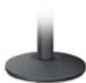
Standard Base 18 lbs. (+0)