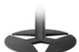
Tri-Base +18 lbs.