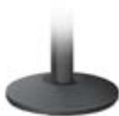
Heavy Base +20 lbs.