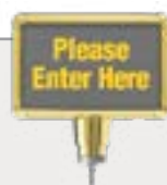
Post-Top Sign Frames