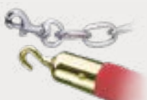
Ropes & Chains