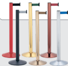
Beltrac® Retractable-belt Posts