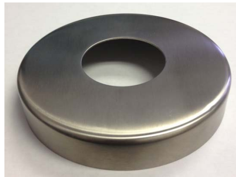
(Design for stainless steel canopies)