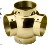
709 Ball 135° Side Outlet Tee