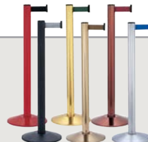
Beltrac® Retractable-belt Posts