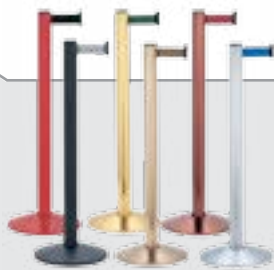
Beltrac® Retractable-belt Posts