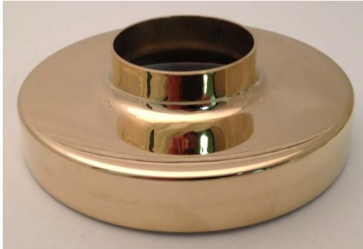
(Design for brass canopies)