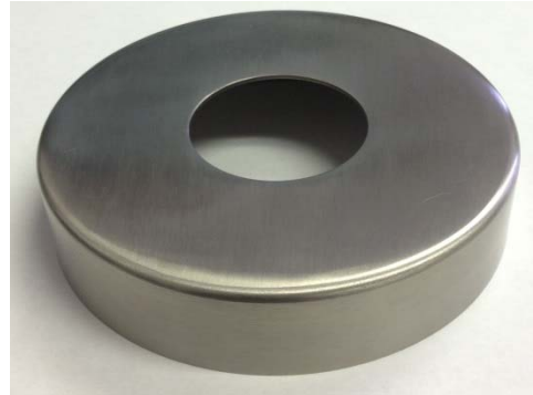
(Design for stainless steel canopies)